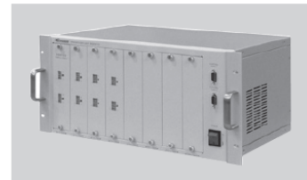
A849101 : Transducer Unit