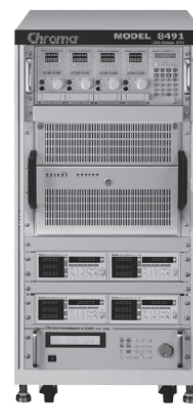
8491 : LED Power Driver ATS